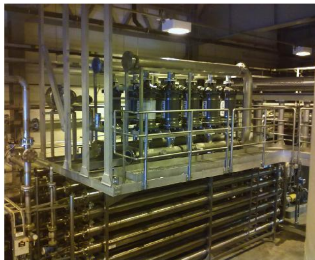
Flooro™ Reverse Osmosis and CO2 degasifier