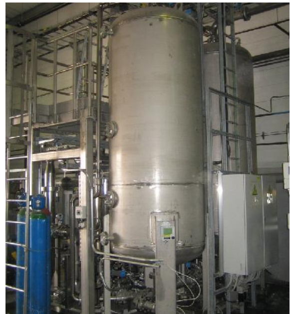
Floomb™ Mixed Bed Ion Exchanger