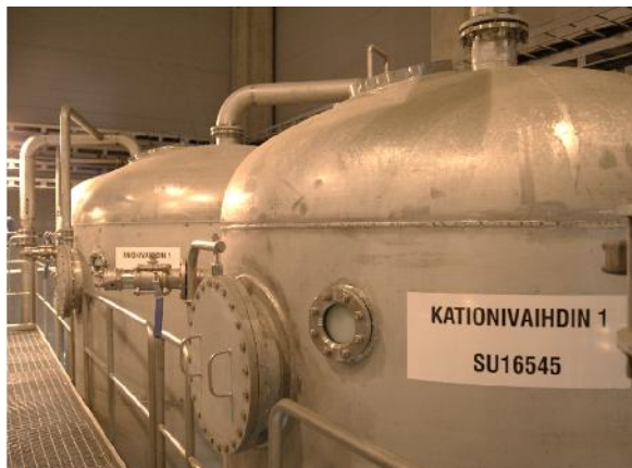
FlooX™ Ion Exchangers